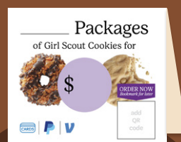
Table Tents: Supply a set of table tents for Girl Scouts to use at cookie booths for ease of payment.